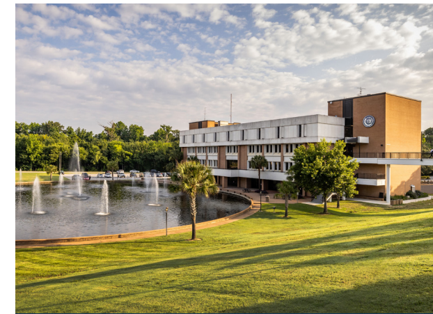
Main Campus 2715 West Lucas Street, Florence