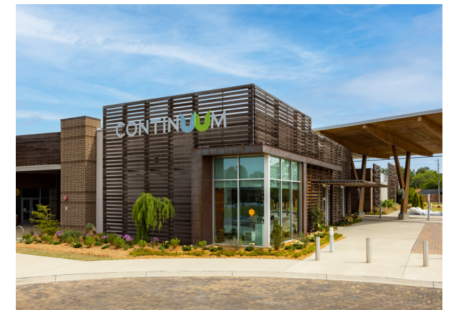
FDTC at the Continuum 208 West Main Street, Lake City