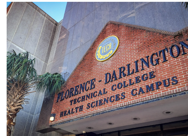
Health Sciences Campus (HSC) 320 West Cheves Street, Florence