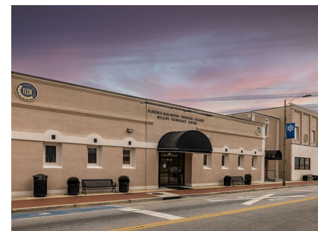
Mullins Campus 109 South Main Street, Mullins