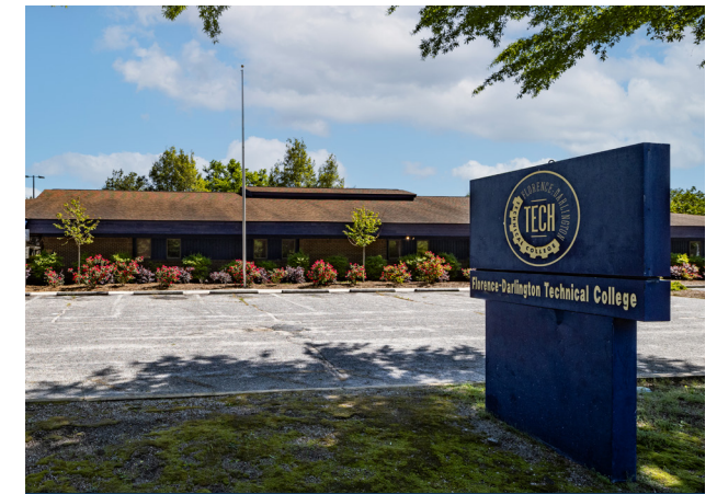
Hartsville Campus 225 Swift Creek Road, Hartsville